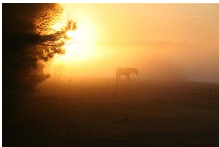
WINNER 2ND—DAWN FAUGHT