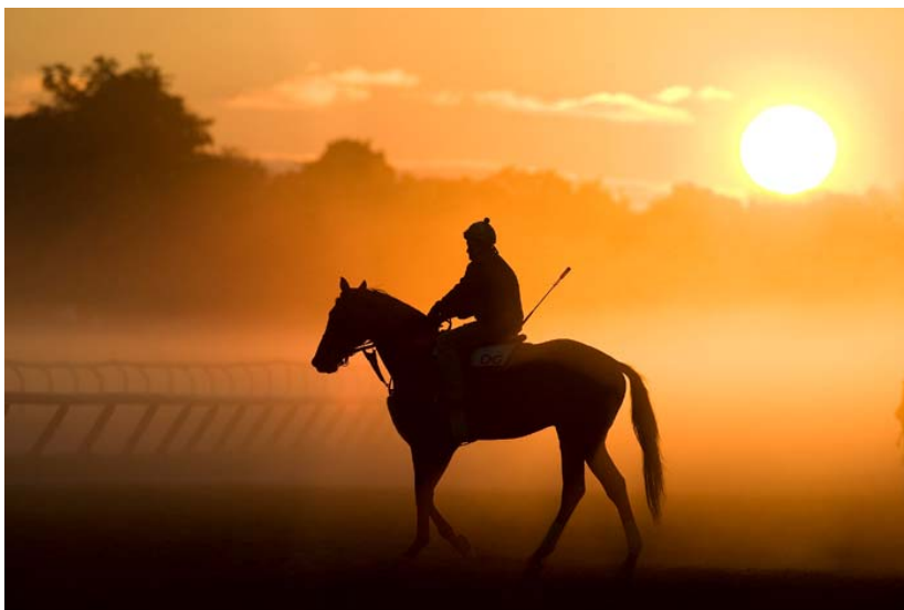
WINNER—TOD MARKS THE SARATOGA SPECIAL