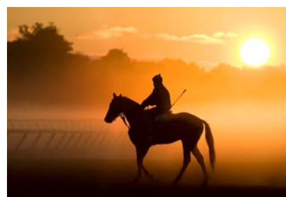
1ST--TOD MARKS THE SARATOGA SPECIAL